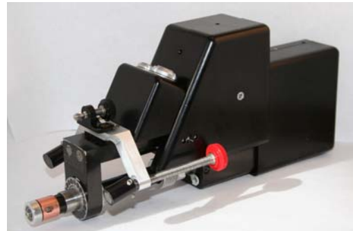
Bushing Scanner BSH 0.5